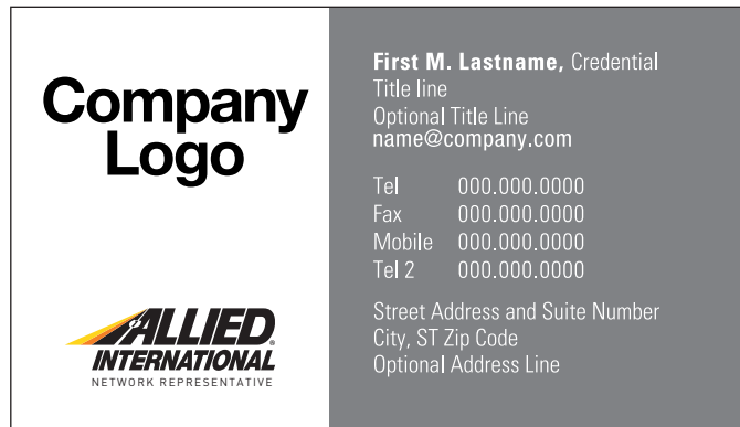
SAMPLE OF PERMITTED LOGO SIZE